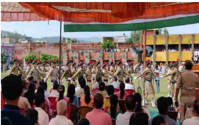
NCC Unit of GDC Ramnagar Participated in parade held on Independence day 2017