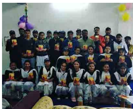
Staff and Students participating in the Swami Vivekananda Birthday