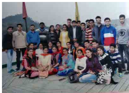
Eduactional tour at Mansar wild life sanctuary