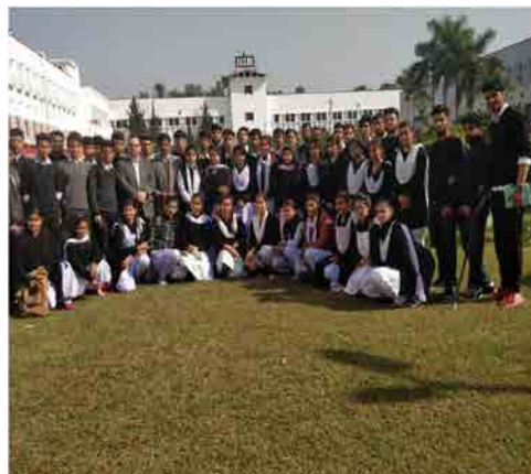
Group photograph of students with scientist of IIM Jammu