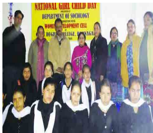
Winner Students with staff participating the seminars