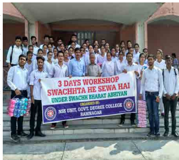
Students participating at NSS workshop