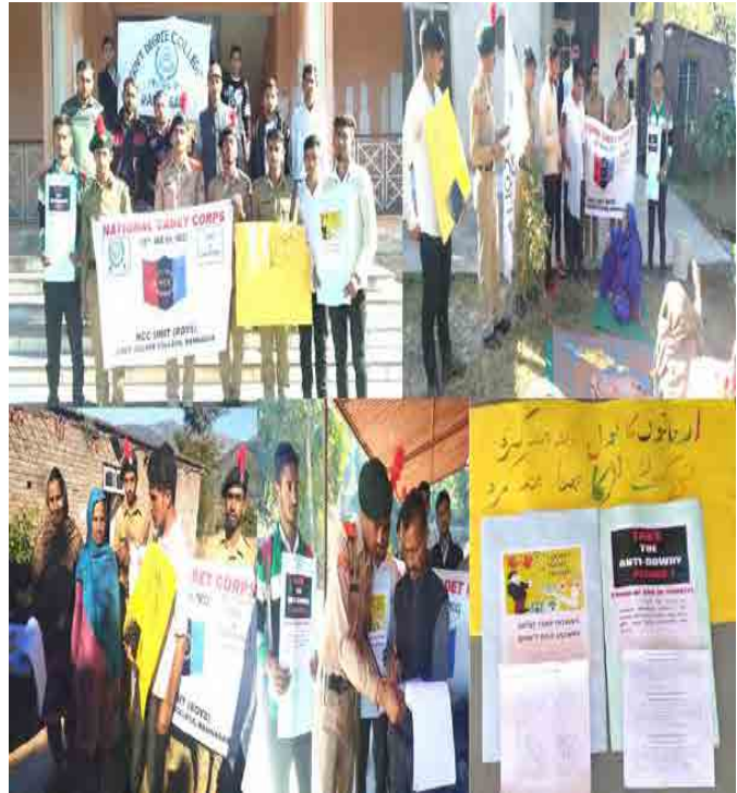
Anti dowry Campaign conducted by NCC unit of GDC Ramnagar