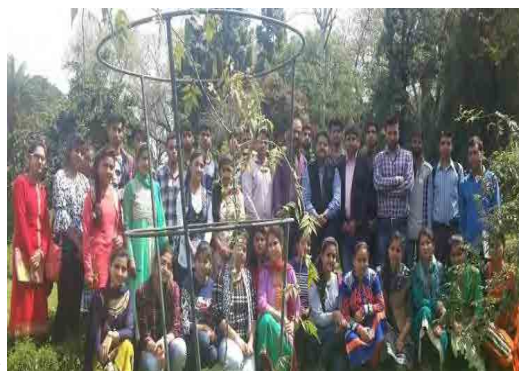
Science students at botanical garden of Jammu University

also visited the medicinal plants section of the garden. Expressing their excitement, the students observed that this garden is an eye-opener for those stakeholders who have only read about these plants but not seen the variety of plants growing at one place that too in a proper classified way.