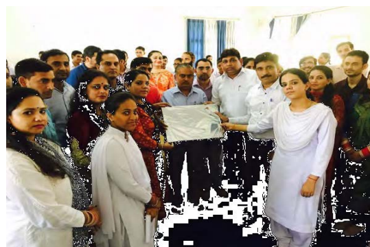
Teacher Day celebration at GDC Ramnagar