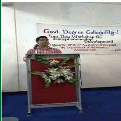
Resource person addressing the students participating in the workshop