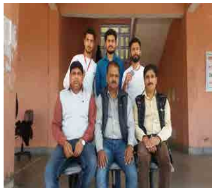
Bronze medal at 44th Annual athletics meet in Jammu University won by NCC cadets oGDC Ramnagar