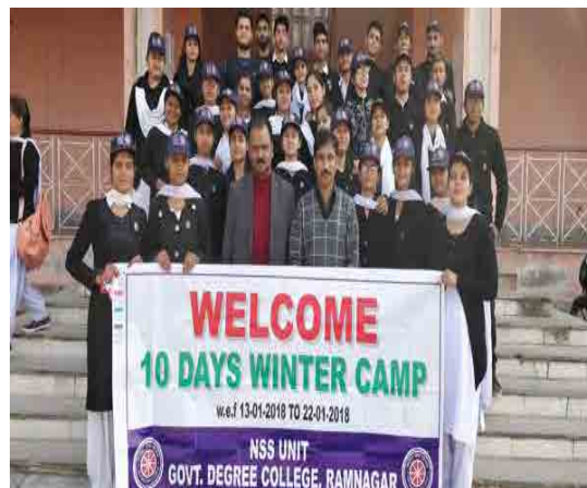
NSS Students Participating in Ten Day NSS winter Camp