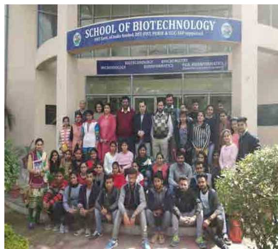
Science students of 6th semester visits School of biotechnology at Jammu university