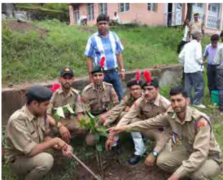
Plantation drive conducted by NCC unit of GDC Ramnagar