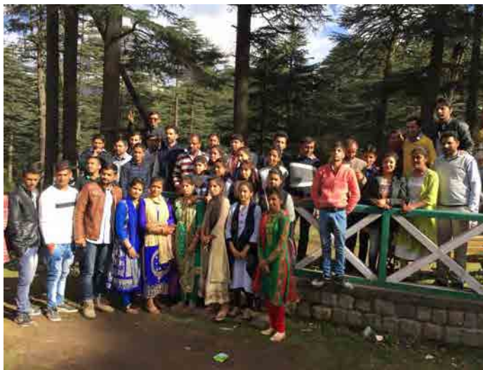
Students and college staff in College Picnic at Patnitop