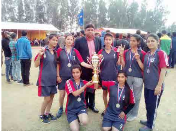
College Women Volleyball Team with runner up trophy at