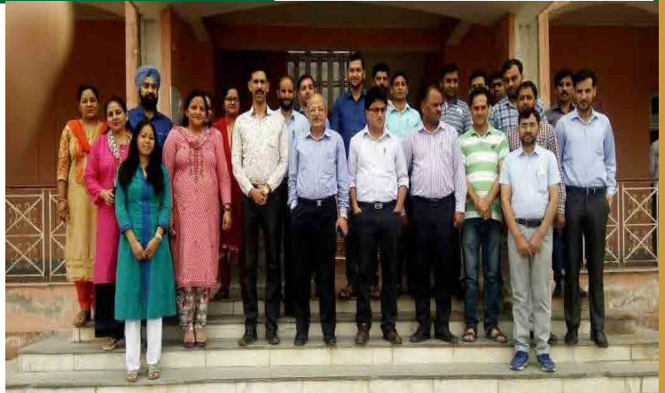
Director college interacted with staff of GDC Ramnagar