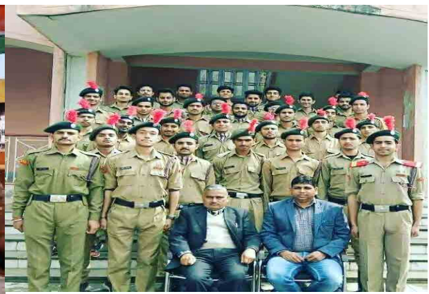
NCC Unit of GDC Ramnagar for batch 2017-18