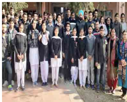
Group photographs of students attended two science congress