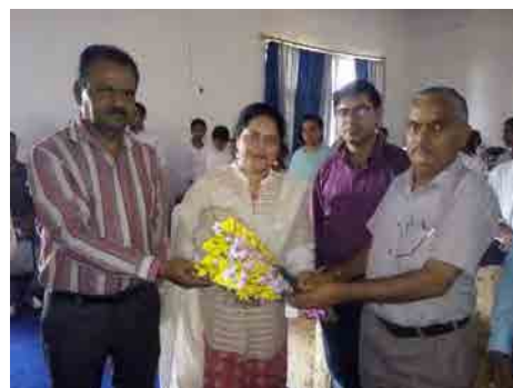
Principal presented Bouquet to guest at workshop from Jammu University