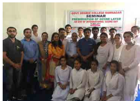
Group Photograph with Students and Faculty members at the seminar