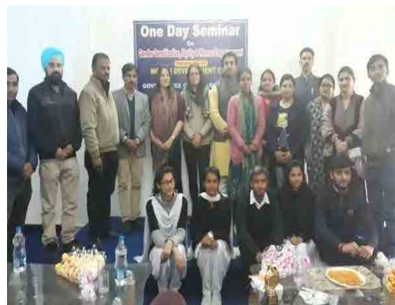
Resource persons with staff and students of GDC Ramnagar