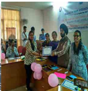
Students of GDC Ramnagar awarded in the workshop on youth ambassadors