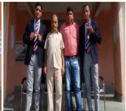
silver medal won by NCC cadet at TSC Delhi Aug 2017