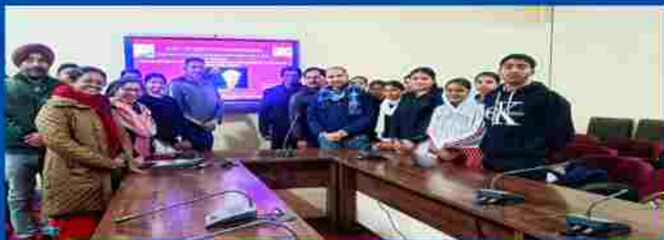
One-Day Seminar on 'Empowering Indian Youth for Global Leadership in Science and Innovation for Viksit Bharat' Organized at GDC Ramnagar on the occasion of National Science Day February 28 th 2025