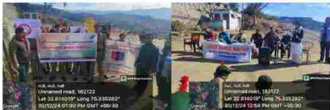
December 30, 2024: Unnat Bharat Abhiyan Cell, NCC Unit, Department of Chemistry and NCORD Cell of GDC Ramnagar Conducted Village Outreach Programme in Batota (Bhatiyari) on December 30, 2024.