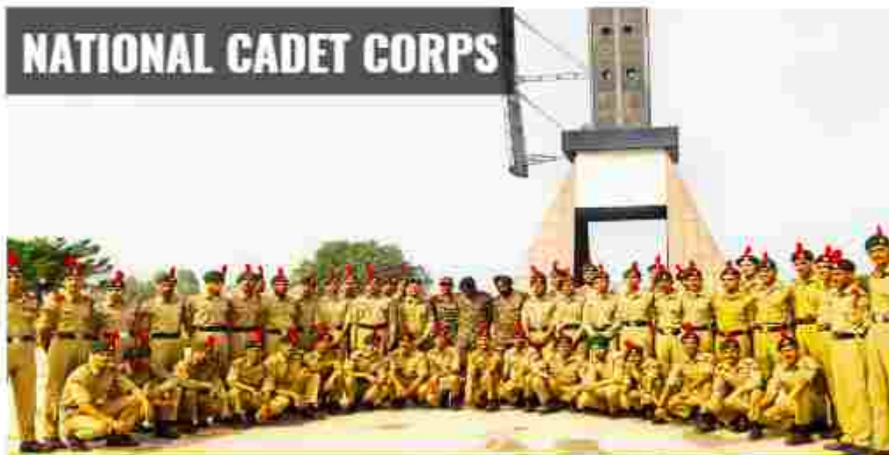
Army attachment camp at 25 Raj Rif, Sunjwan, Jammu from 15-10-2024 to 26-10-2024