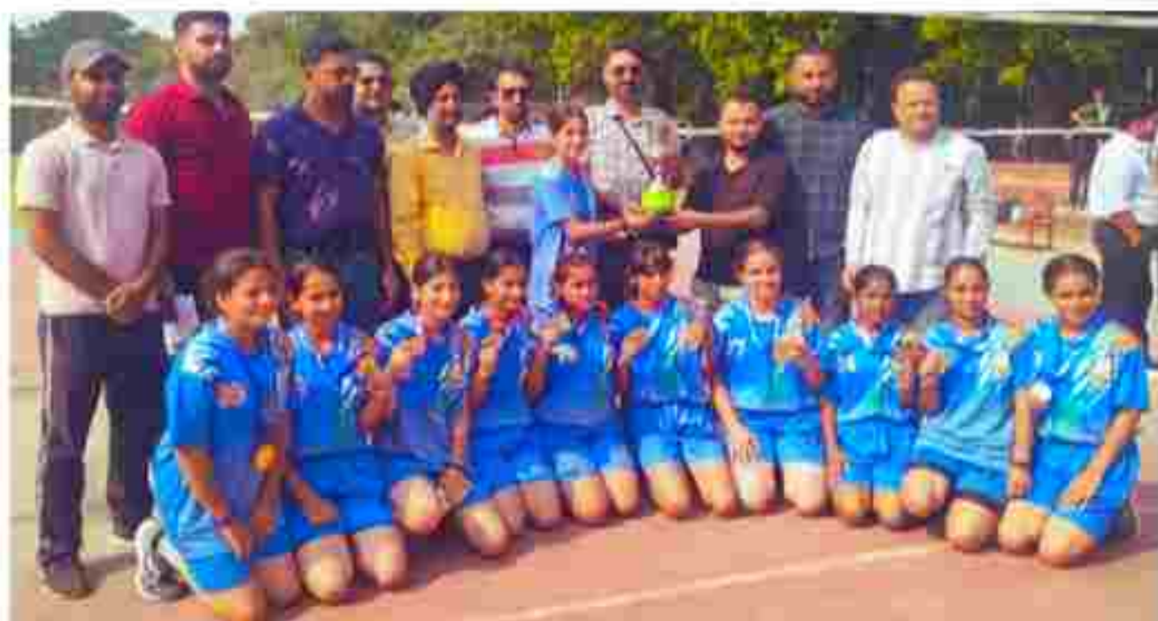
College women volleyball team won Volleyball Intercollegiate Championship 2024-25 held at University of Jammu w.e.f.15.10.2024 to 19.10.2024