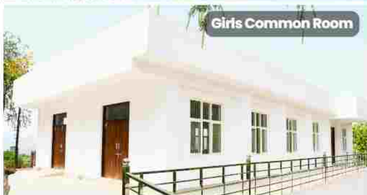
Girls Common Room