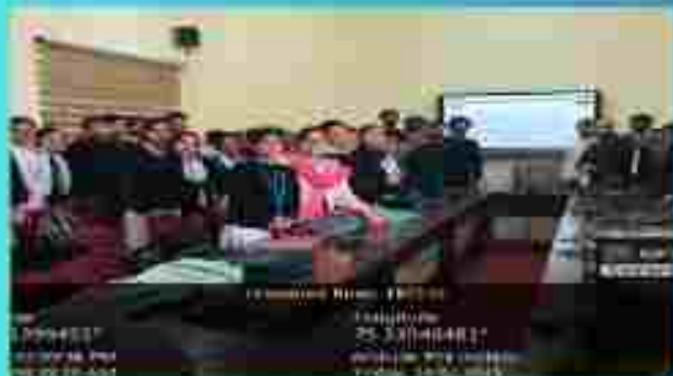
Department of Physics, GDC Ramnagar Organizes Guest Lecture on 'Exploring Emerging Technologies: A Glimpse into the Future' on 14.02.2025