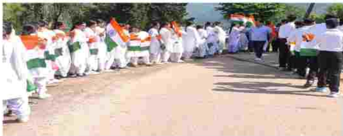
AUGUST 13, 2024: Tiranga Rally and Marathon by students under Unnat Bharat Abhiyan (UBA) at village Thaplal, Ramnagar